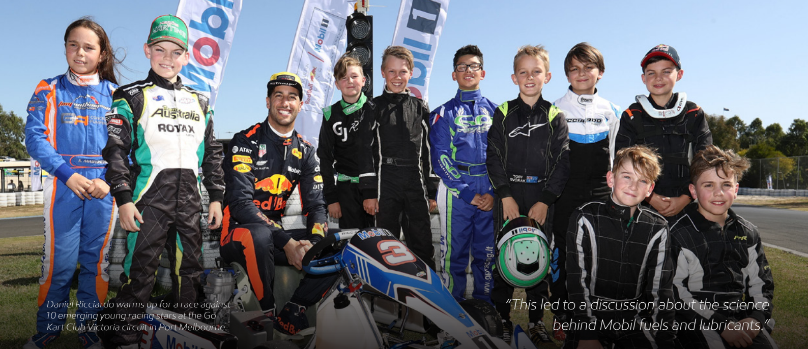
Daniel Ricciardo warms up for a race against 10 emerging young racing stars at the Go Kart Club Victoria circuit in Port Melbourne.