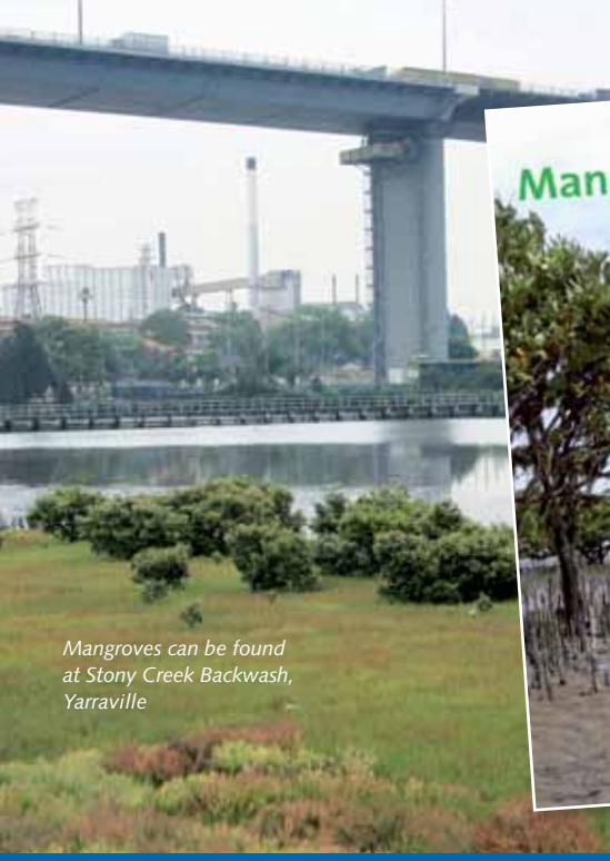
Mangroves can be found at Stony Creek Backwash, Yarraville