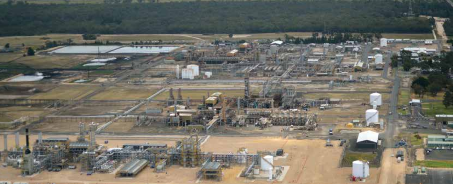
The Longford Plants. "The Victorian Government advises that there has been no evidence of PFAS affecting the health or production of grazing livestock in Australia."