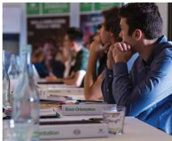
New apprentices undergo induction training in Sale.

Welcome to the first issue of our community bulletin. Throughout our history of operations here in Gippsland we have always strived to be a valued member of our community.