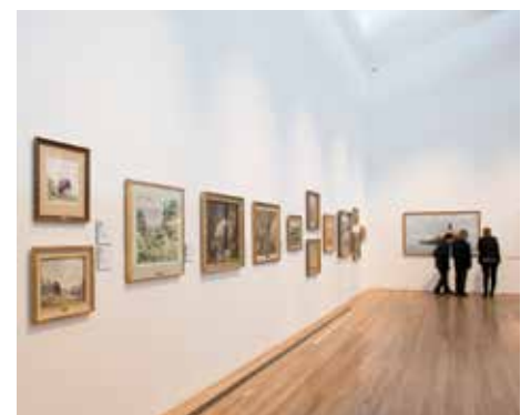
The Esso Collection at the Gippsland Art Gallery.

"It's great to be moving back to our old building"