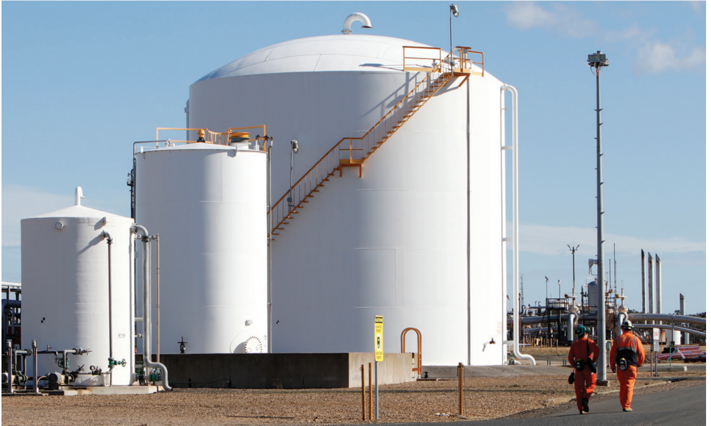
Longford Plants. "We have a number of ways to communicate with the local community."