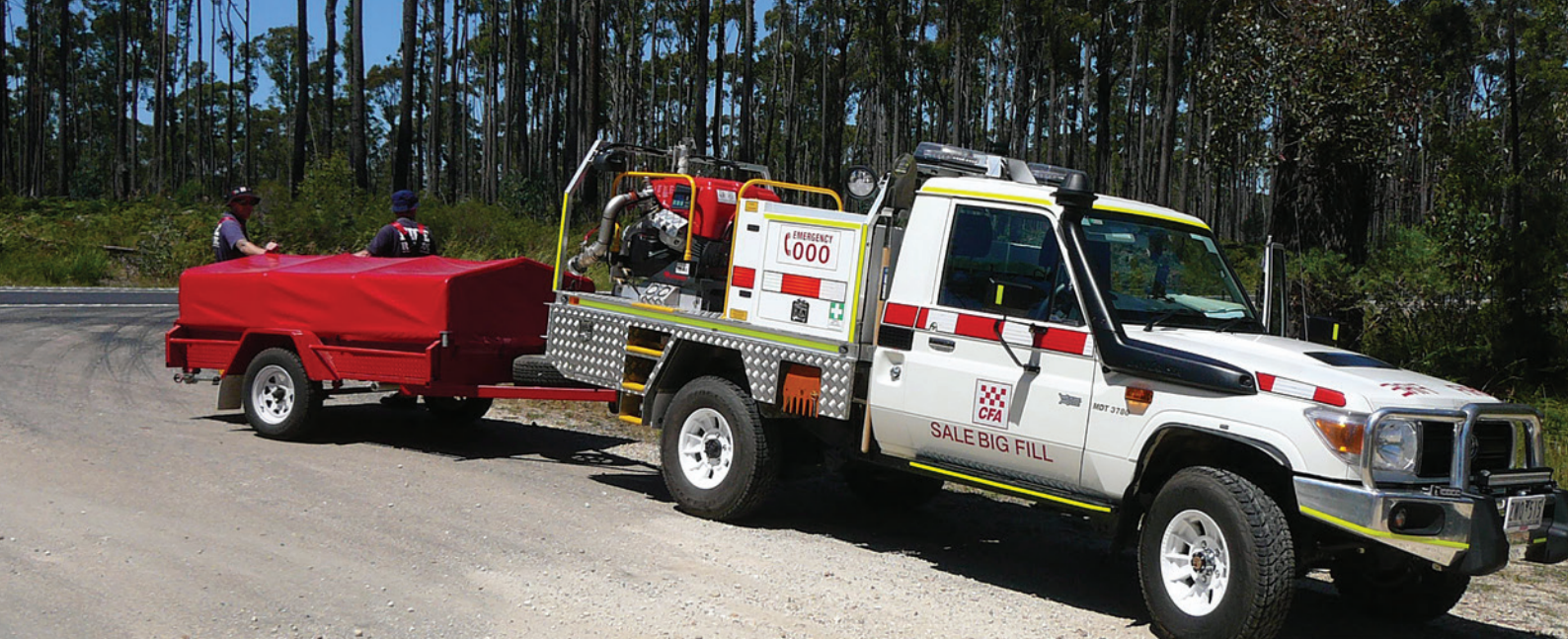
The Sale Big Fill carries a large pump and plays a critical role on the fire-ground by rapidly refilling fire trucks and carriers with water.