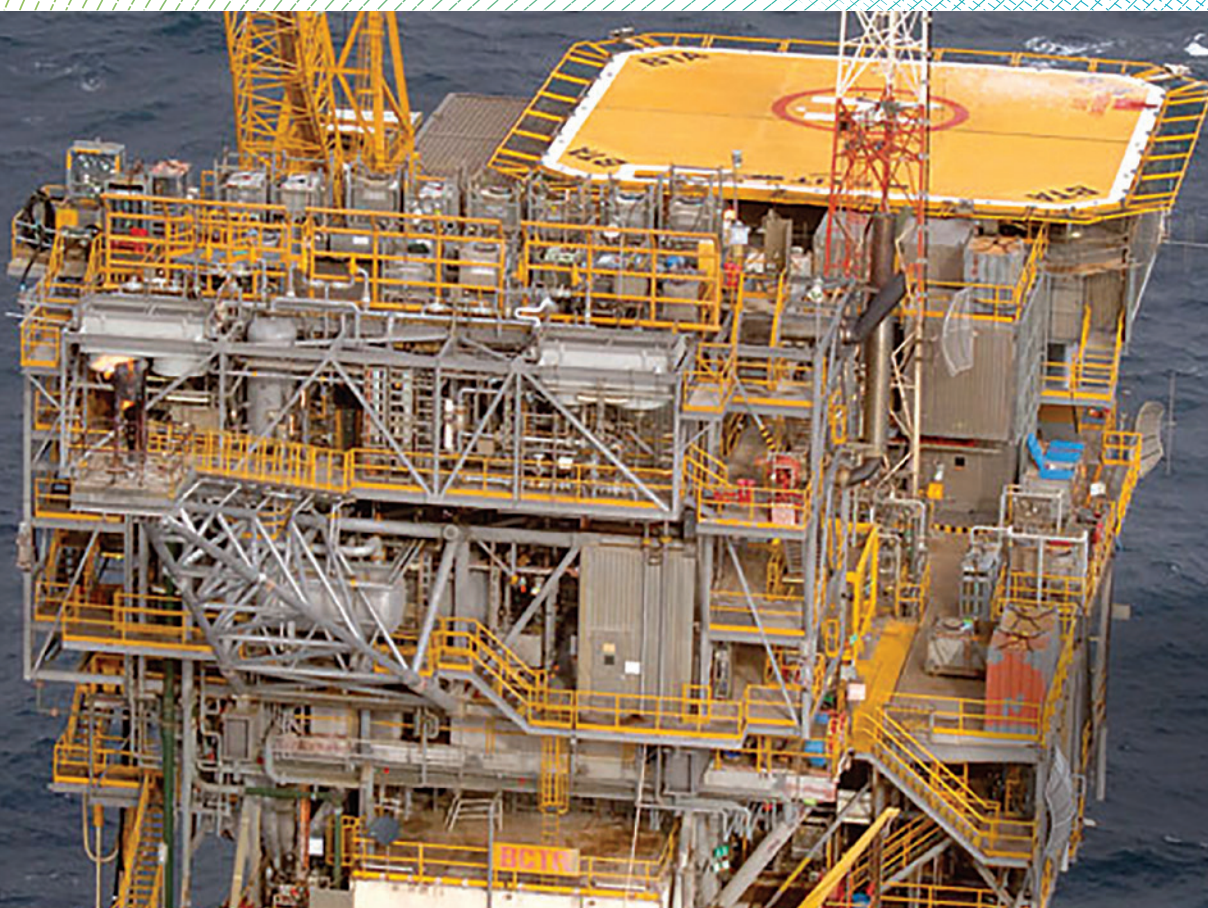
Pictured is our Barracouta platform in Bass Strait.