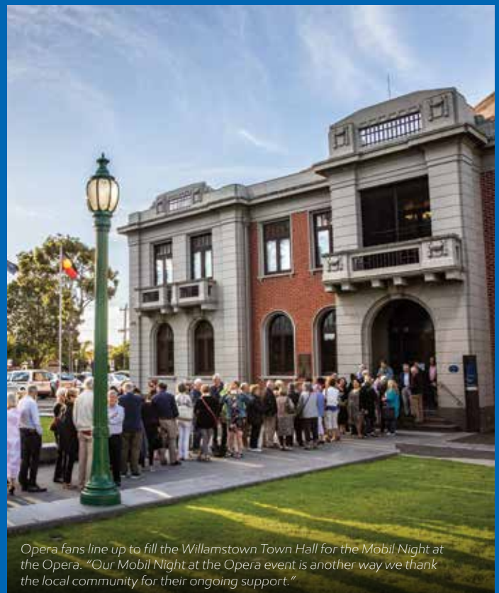
Opera fans line up to fill the Williamstown Town Hall for the Mobil Night at the Opera. "Our Mobil Night at the Opera event is another way we thank the local community for their ongoing support."

"Our community concert was yet another opportunity for us to spend time with our neighbours outside of work and for the community as a whole to enjoy a fun night of fantastic music as we celebrate the tenth anniversary of this wonderful event, and significantly, the 70th birthday for the Altona Refinery," he said.