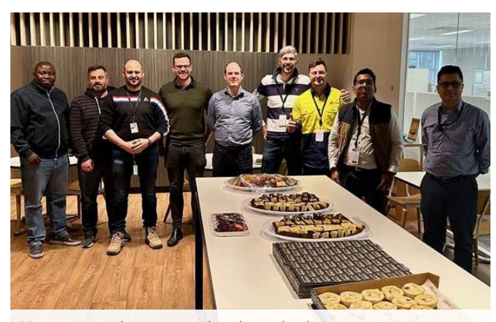
New team members are warmly welcomed with a morning tea at Altona Terminal.

"Our aim is that these Terminal Operators will play a key role in our long-term future as the Melbourne Terminal."