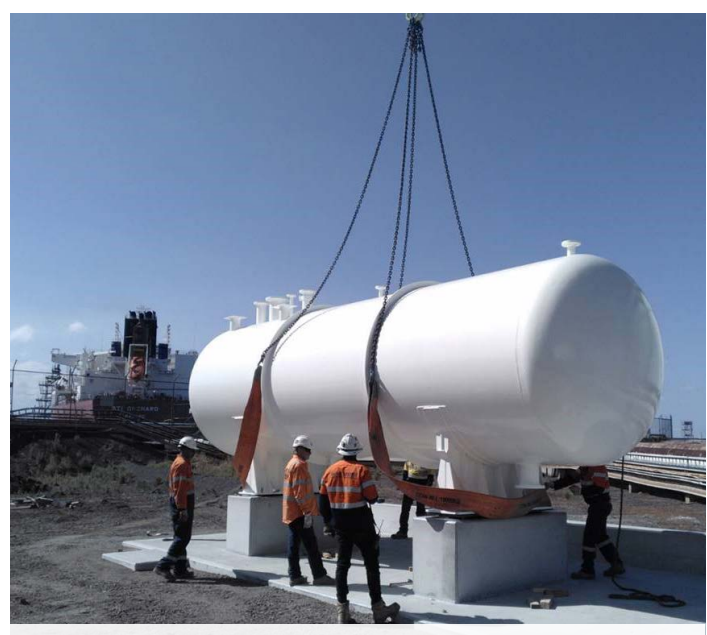
Major projects are underway across both terminals and at Gellibrand.

In 2024, the Melbourne Terminal team continues its focus on increasing petrol and diesel storage to support Victoria's fuel supply and strengthen Australia's fuel security.