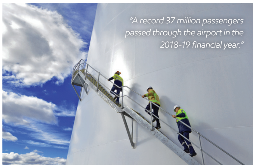
A new jet fuel tank at Melbourne Airport.