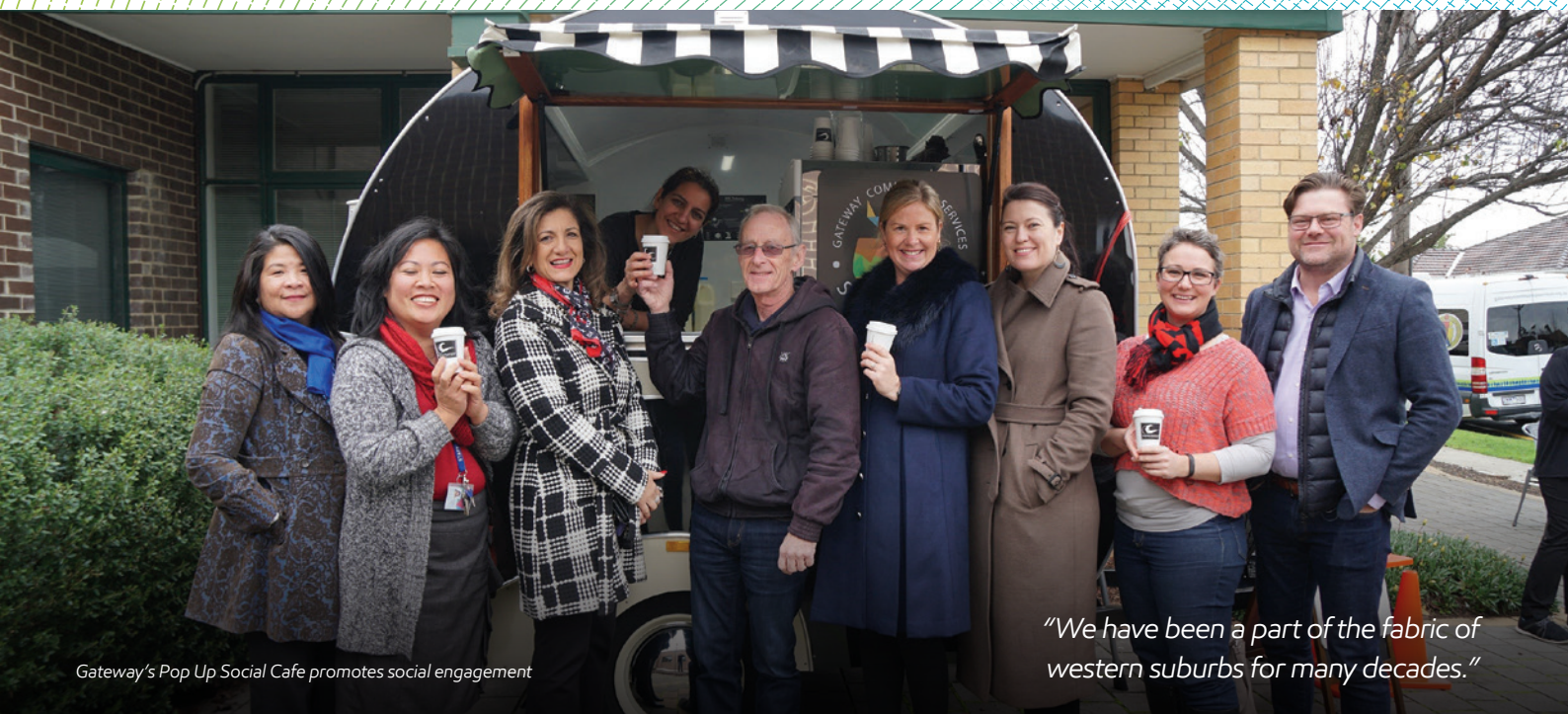
Gateway's Pop Up Social Cafe promotes social engagement

"We have been a part of the fabric of western suburbs for many decades."