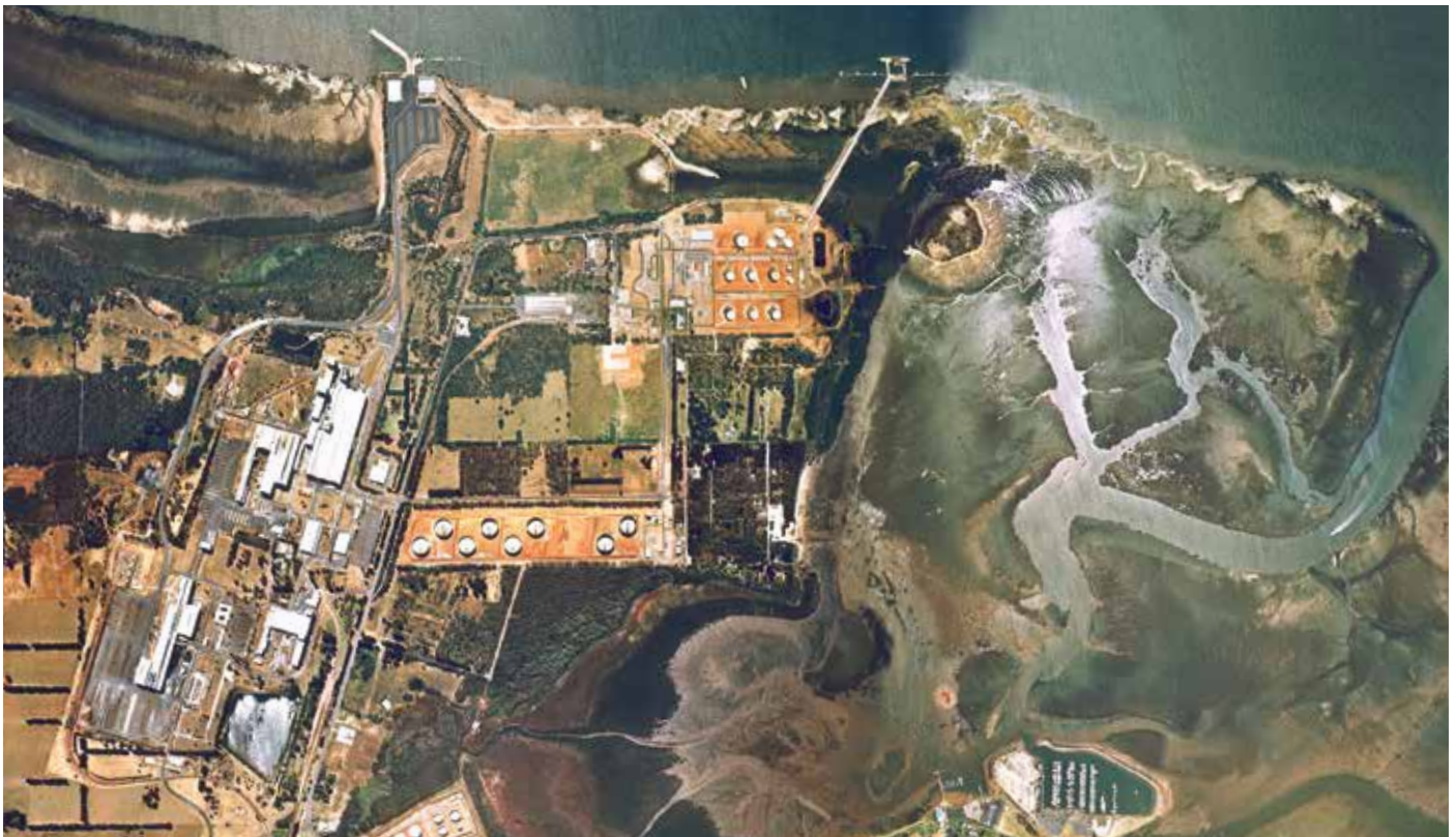
Long Island Point plant from above.

Esso is committed to maintaining safe, healthy and environmentally responsible operations at all of its sites. Esso supports all efforts to reduce the potential for a major incident to as low as reasonably practicable at Long Island Point and all its sites. Although the probability of a major incident occurring is low, measures are in place to ensure that the consequences from such an event are also reduced to so far as reasonably practicable.